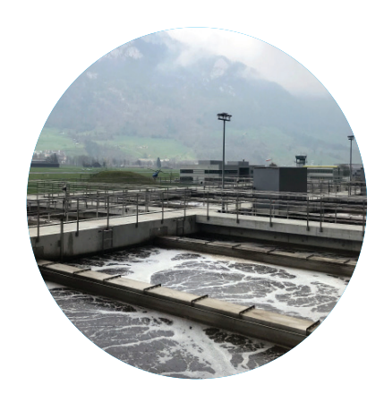
Share with us the fascination of international project business and join us in implementing creative and sustainable solutions.